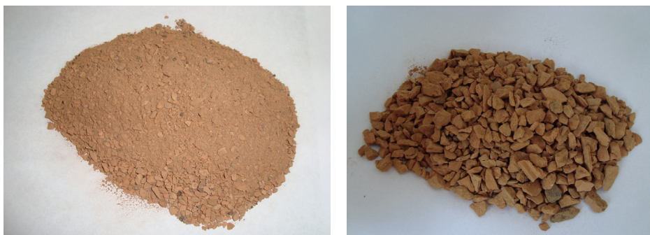
Fig. 1 Crushed brick -fractions 0/4 and 4/8mm

Natural river aggregate and crushed bricks aggregate were used. After demolition of masonry structure bricks were crushed and separated into fractions 0/4, 4/8 and 8/16 mm (see Figure 1).